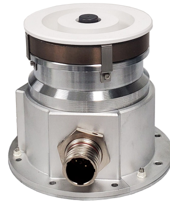
Figure 2: ACE Thruster